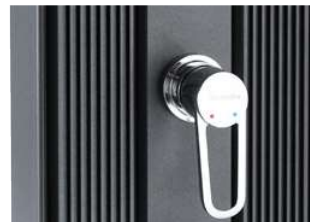
Laser-engraved stainless steel mixer tap