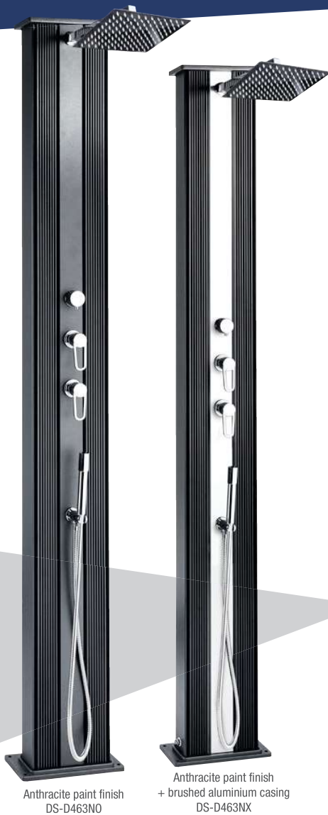
Anthracite paint finish DS-D463N0

Formidra is renewing its flagship model, the DADA. Available in both straight and curved versions, it combines Formidra's ecological solar 40L-capacity technology with a hot water intake to ensure that hot showers are available whatever the number of users.