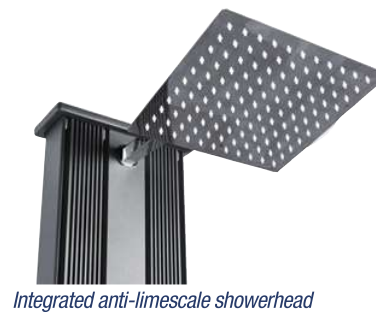
Integrated anti-limescale showerhead